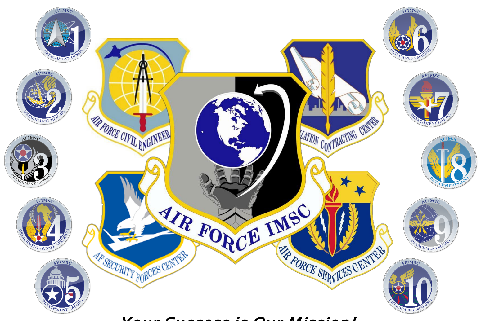
Your Success is Our Mission!